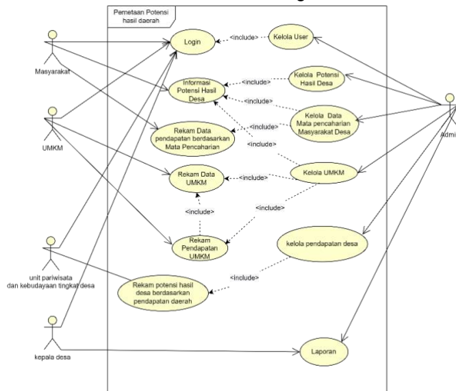
Fig. 2for Mapping Regional Yield Potential

Pabean Udik Village is a coastal area with significant potential for natural resources and local wisdom, ranging from fisheries products, processing industries, to traditional batik culture. However, these various potentials have not been optimally developed due to several fundamental problems covering social, economic, educational, and infrastructure aspects. Based on the results of field identification, several key issues were identified, such as the failure of mangrove tourism development due to location limitations and damaged infrastructure, the low welfare of fishermen due to dependence on middlemen, and the suboptimal management of BUMDes business units due to limited human resource capacity. In addition, other challenges include the low level of community education which has an impact on the high rate of early marriage, the lack of regeneration of batik artisans, and limited promotion and digitalization in the salted fish and shrimp paste industry center. To address these challenges, a structured analysis was conducted based on mapping the relationship between problems, root causes, and solutions that can be applied contextually.