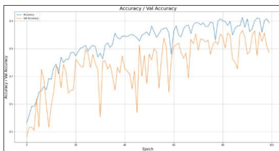
Fig. 3: Accuracy/Val Accuracy

Figure 2 shows the closing movement of stock prices with X label being days and Y label being price. The graph depicts stock price predictions for the next 20 days that the next 20 days stock price movements will decrease drastically.